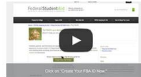
How To Create An FSA ID