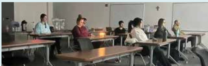
De-Stress for Success 2023

This event is organized by the Faculty and Staff in Pittsburgh for the ABSN students just before they embark on their finals! This event is run the week before finals every semester. The students indulge in delicious snacks and tea while enjoying a relaxing guided meditation. The room is filled with wonderful-smelling aromatherapy oils and great company!