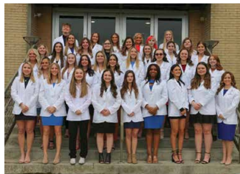
Traditional BSN students White Coat January 2023