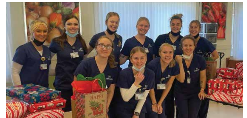
December 2022 - Sophomore students at The Meadows

The senior nursing students participated in the SNAP NCLEX Bowl in November 2022 and placed 3rd out of 11 competitors!! Congratulations!!