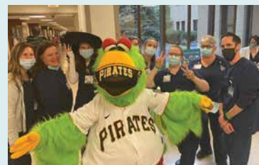
ABS Students with the Pirates Parrot