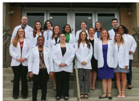
Part-time evening Students White Coat January 2023