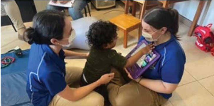
Two Misericordia students work with a young client in Belize using a tablet

facilities, and community homes to work with clients and families who otherwise did not have access to speech therapy services. The students and faculty members involved were all incredibly grateful for this opportunity, and the department intends to continue this service work annually.