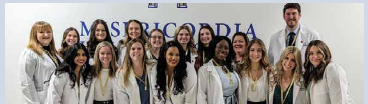
December 2022 Graduates

Bachelor of Science in Nursing (ABSN) program, building upon the University's nearly century-long tradition of graduating nurses. Since the start of the program, 88 students earned their BSN from Misericordia University at the Pittsburgh campus.