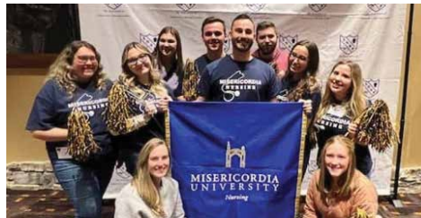
November 2022 - Senior Students at the NCLEX Challenge