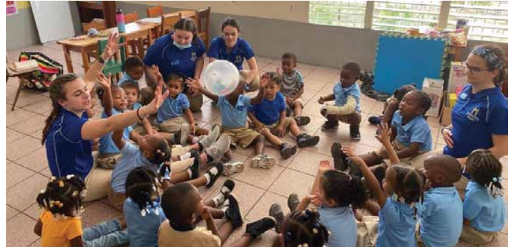
A group of Misericordia students plays with preschool students on their service trip to Belize