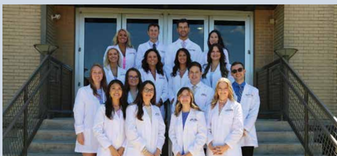
The MUPA Program Graduating Class of 2022

The 2022/2023 academic year brought positive changes and growth to the Misericordia University Physician Assistant (MUPA) Program. We graduated our third cohort, progressed our fourth cohort to clinical rotations, and welcomed our fifth cohort in July 2022. In Fall of 2022, the Accreditation Review Commission for the Education of Physician Assistants, Inc. (ARC-PA) granted "Accreditation-Continued" status to the MUPA Program. The approximate date for the next validation review of the program by the ARC-PA will be September 2032. In addition, the graduating class of 2022 achieved a 100% first-time-taker pass rate on the Physician Assistant National Certification Examination (PANCE).