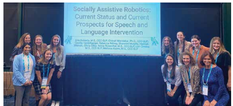
Speech Language Pathology continued on page 18