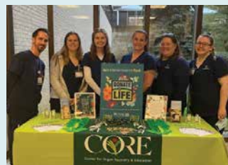
ABS students at CORE table

A group of ABSN students volunteered their time at the CORE table set up in the lobby of Allegheny General Hospital during Organ Donation Month this past April. The students were there to answer any questions passersby might have had about the process of organ donation. They even got to meet the Pittsburgh Pirate Parrot!