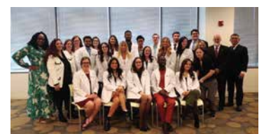
White Coat Ceremony, Pittsburgh, April 2022