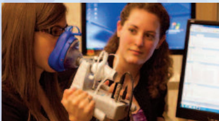
Phonatory Aerodynamic System (PAS)

The results from these studies are expected to continue to validate a novel integrated implicit-explicit voice therapy protocol, which we believe will be an effective option for clinicians who treat voice disorders and individuals who receive voice therapy.